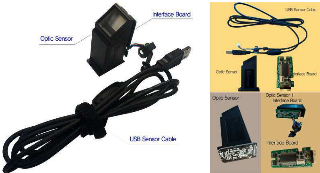
[Fig. 1] FDU08 fingerprint scanner module